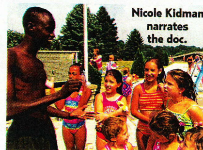
Nicole Kidman narrates the doc.