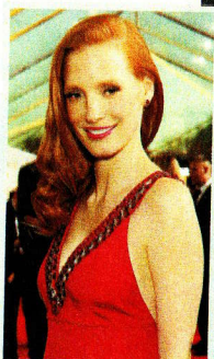
Chastain got a best supporting actress nod in 2012 for The Help .