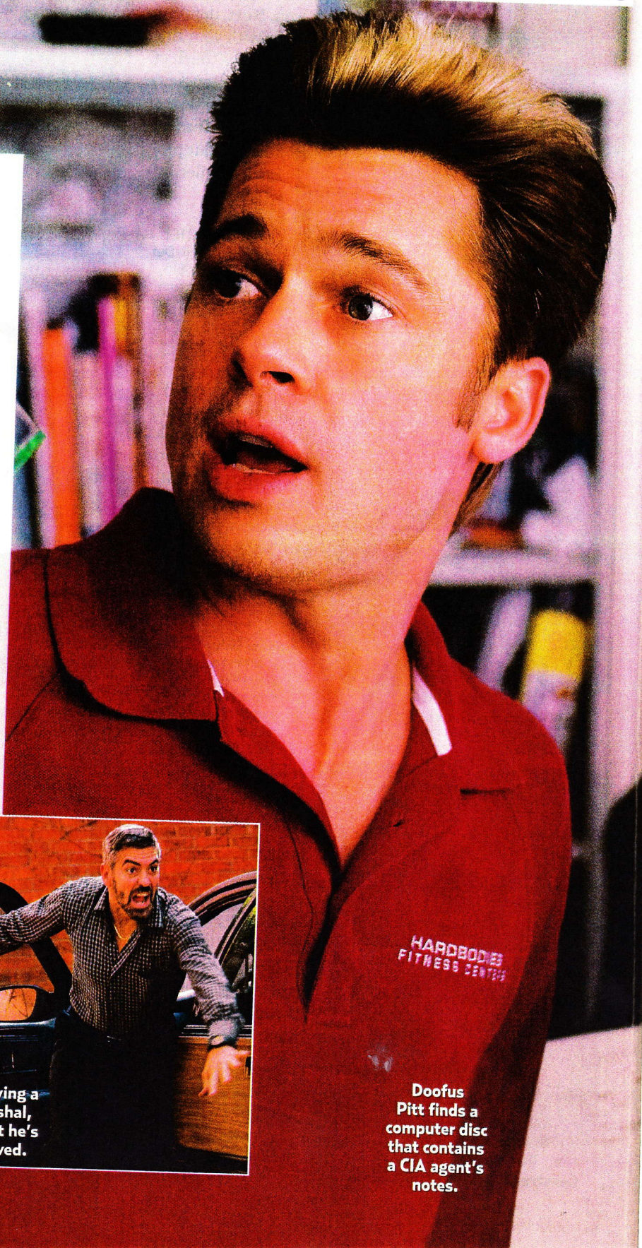
Doofus Pitt finds a computer disc that contains a CIA agent's notes.