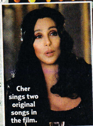
Cher sings two original songs in the film.