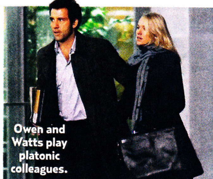
Owen and Watts play platonic colleagues.

Fisher (center) with the editor of her fave fashion magazine (Kristin Scott Thomas, left) and her professional and romantic rival (Leslie Bibb).