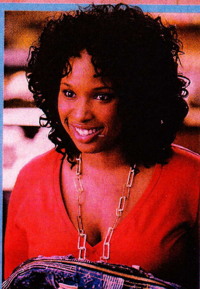
Hudson stars this October with Queen Latifah in The Secret Life of Bees .