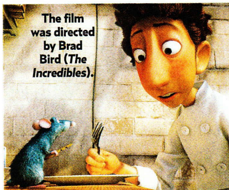
The film was directed by Brad Bird ( The Incredibles ).