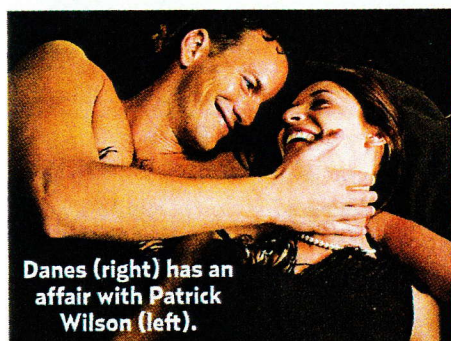
Danes (right) has an affair with Patrick Wilson (left).