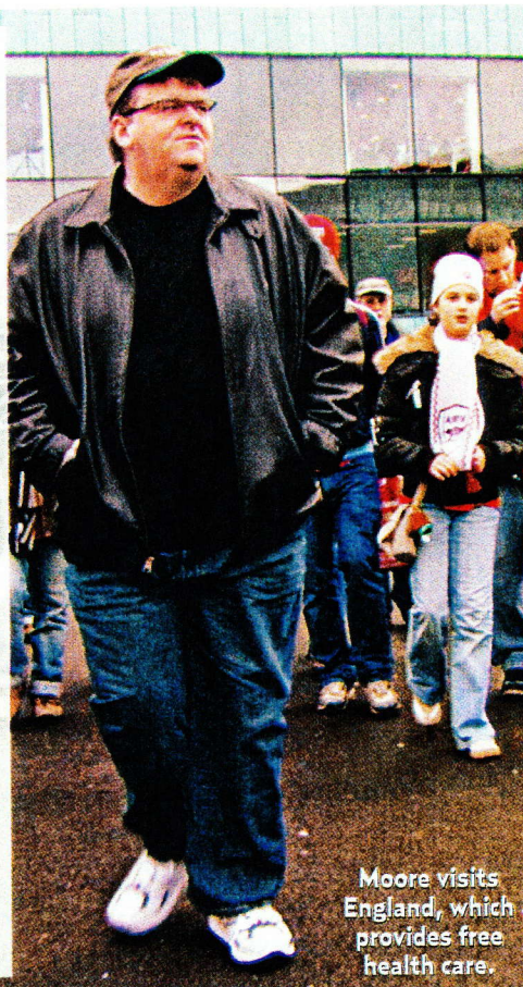
Moore visits England, which provides free health care.