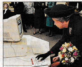
The monarch at the keyboard

GREAT BRITAIN HAS LOST Hong Kong, but that hasn't stopped Queen Elizabeth II from trying to conquer the World Wide Web. Buckingham Palace says that Her Majesty periodically scans the 1,000