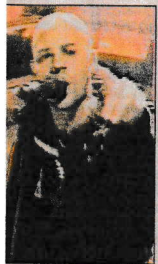
Chris Daughtry: A pinted performance.

For the last two episodes of American Idol , the remaining contestants may just be able to make it in. Based on Tuesday night's performances of Katharine McPhee, the only woman in the final four, it will be a boys' club from now on.